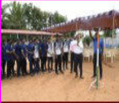
PHOTO GALLERY: OLYMPIC TORCH & OATH