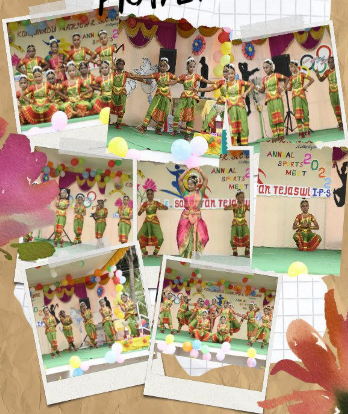
PHOTO GALLERY PRAYER DANCE