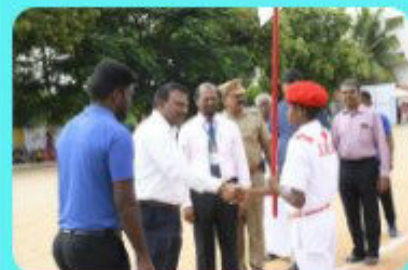
MARCH PAST FILE

"Your dreams are what define your individuality. They have the power to give you wings and make you fly high." - PV Sindhu