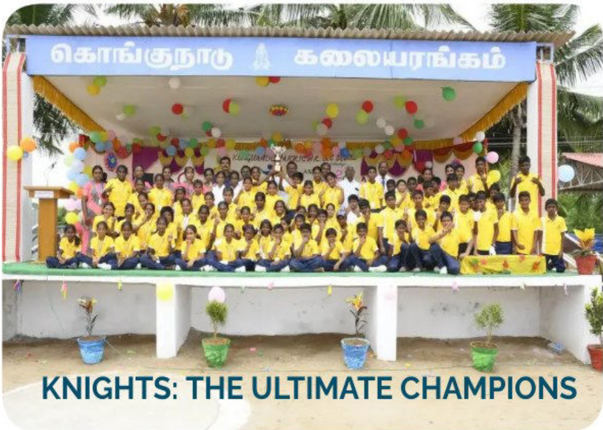
The Chief Guest is being honoured