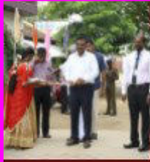
PHOTO GALLERY: INAUGURAL FUNCTION