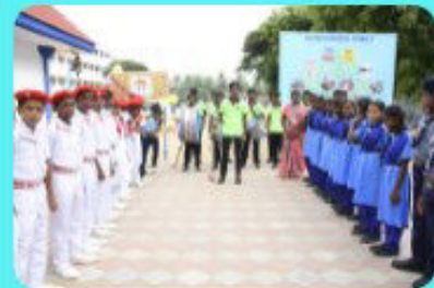
SCOUTS & JRC